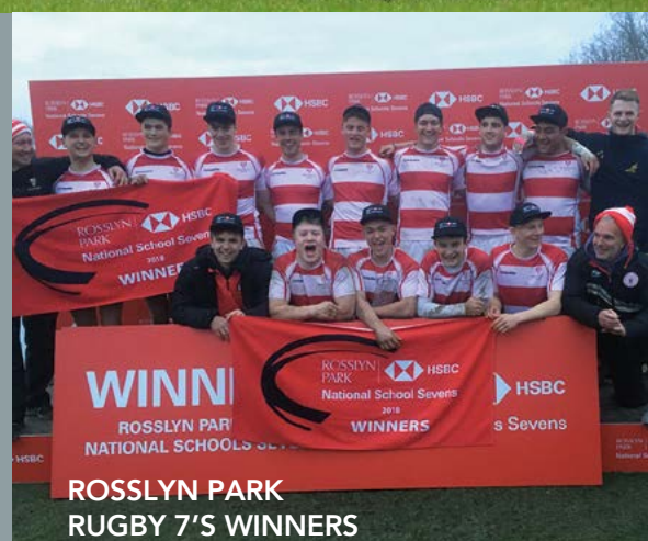
ROSSLYN PARK RUGBY 7'S WINNERS

IN THE PAST FIVE YEARS OVER A HUNDRED BLUNDELLIANS, BOYS AND GIRLS HAVE COMPETED AT COUNTY LEVEL OR ABOVE.