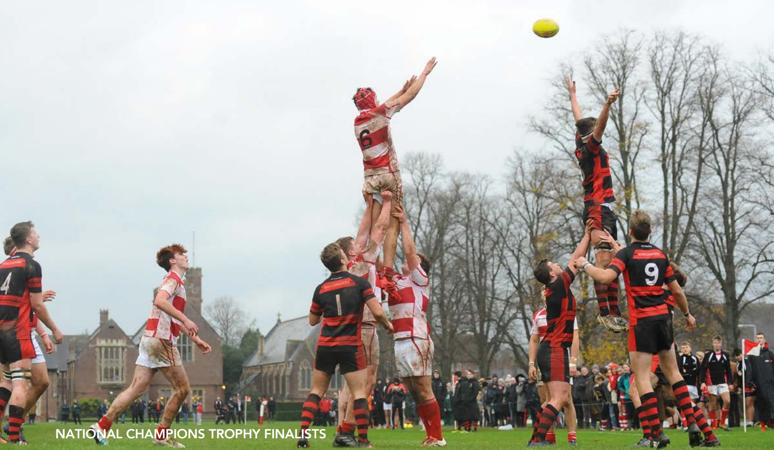
NATIONAL CHAMPIONS TROPHY FINALISTS