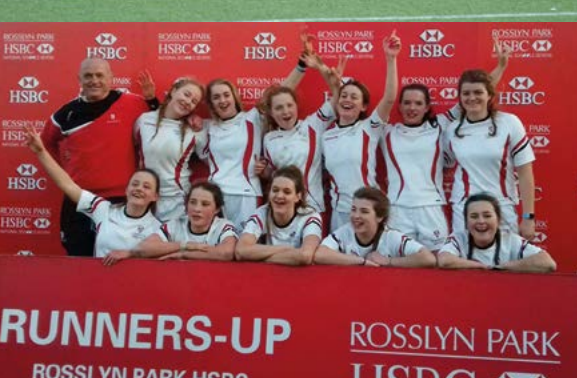
RUNNERS-UP ROSSLYN PARK